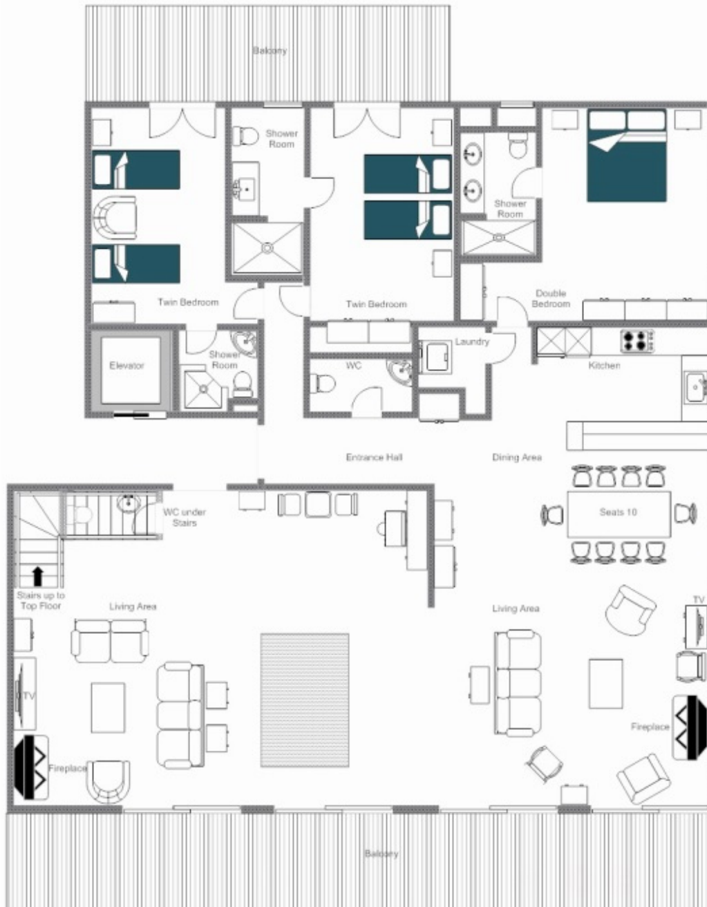
SKYE - LOWER FLOOR, FOR ILLUSTRATION PURPOSES ONLY