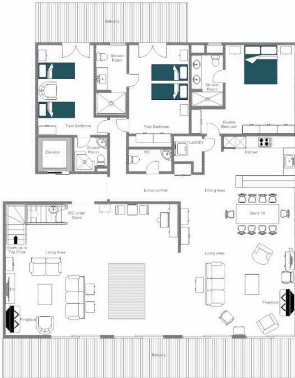
SKYE - LOWER FLOOR, FOR ILLUSTRATION PURPOSES ONLY